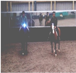
Using head torches in the Arena because of the light

Here at the TRC, during the winter months, we struggle to give all of our horses as much work as they need, due to the lack of daylight hours. This seriously affects our ability to re-home them as quickly as we would like. We have a great facility in the Hallo Dandy Arena, but due to insufficient lighting, we cannot maximise its potential.