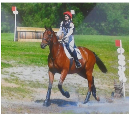
TRC LITTLE NOBBY