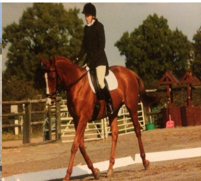
TRC BALLY BORRIS