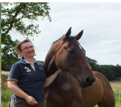
TRC GENIAL GENIE