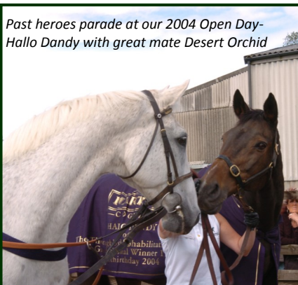
Past heroes parade at our 2004 Open Day- Hallo Dandy with great mate Desert Orchid