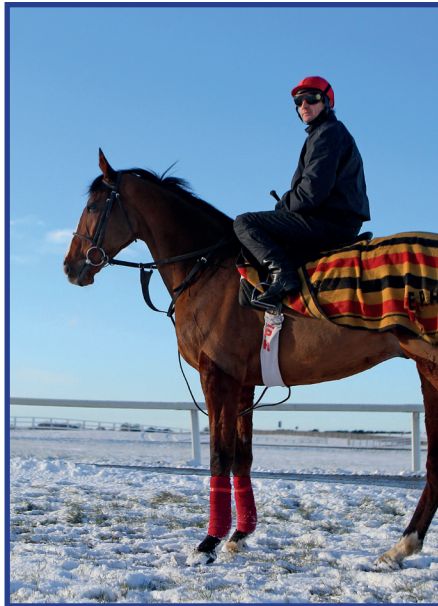
Previous year Christmas Card (Pack of 10) – Captain CeeBee