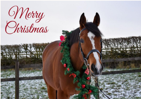
Pack of 5 Christmas Cards: £5

A variety of BTRC Christmas cards clothing and gifts available with all proceeds towards helping TBs Visit www.thebtrc.co.uk/shop