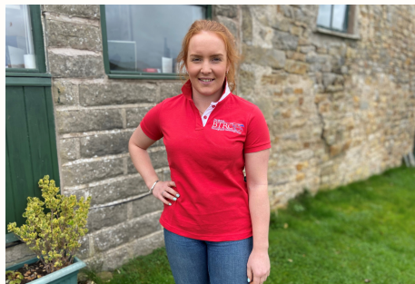
BTRC Polo Shirt: £20.00

Click here to visit the website for more items