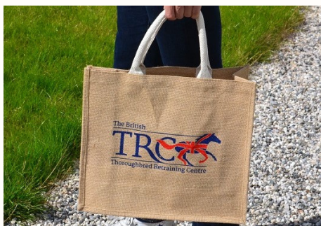
BTRC Jute Bag: £4.99