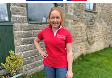
BTRC Polo Shirt: £20.00

Click here to visit the wesbite for more items