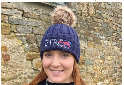
BTRC Bobble Hat: £15.00

A varierty of BTRC clothing and gifts are available with all proceeds going towards helping TBs Visit www.thebtrc.co.uk/shop