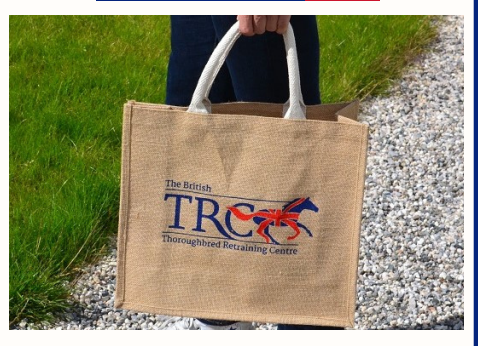
BTRC Jute Bag: £4.99