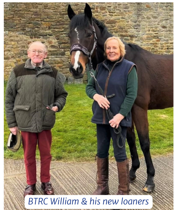
BTRC William & his new loaners

I simply cannot thank BTRC enough for what they did to support me and for their unwavering commitment to William. I know what I did was the right thing for William and I feel having both loaned and gifted from/to the BTRC, I have been able to experience the relentless and passionate work they do in all aspects. THANK YOU BTRC for never giving up and for all that you do... from all the horses, owners and loaners.