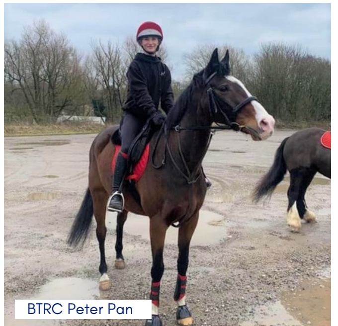
BTRC Peter Pan