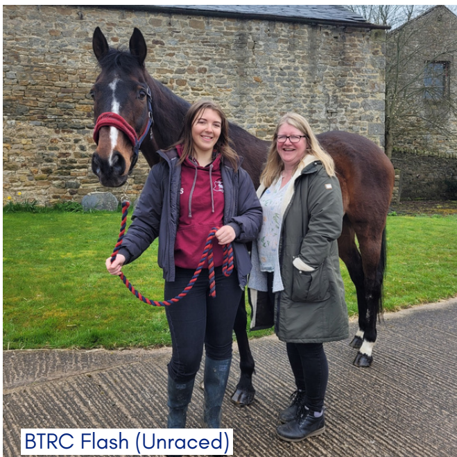
BTRC Flash (Unraced)