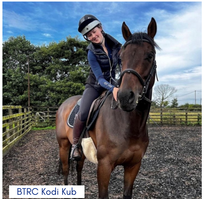
BTRC Kodi Kub