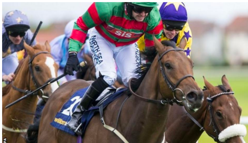
Don't Touch winning the Ayr Gold Cup in 2015

Until Donald came into my life I never thought I'd ever have my own horse let alone get the opportunity to go out and compete so for this I am forever grateful to the BTRC for letting me loan him, he really is one in a million!