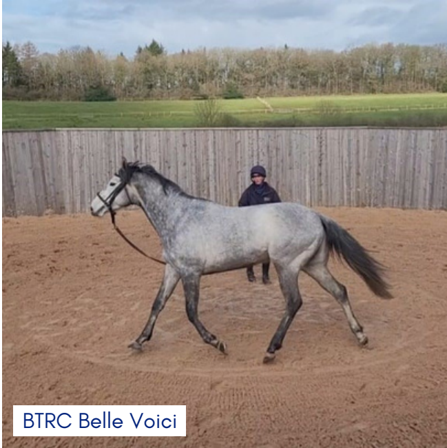
BTRC Belle Voici