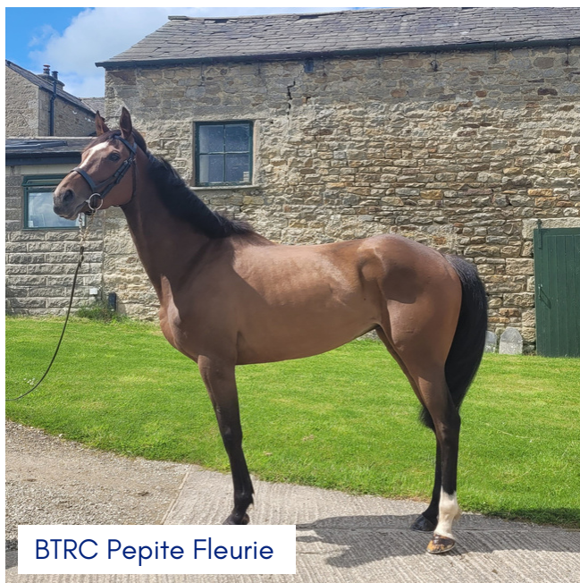
BTRC Pepite Fleurie