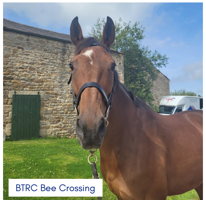
BTRC Bee Crossing