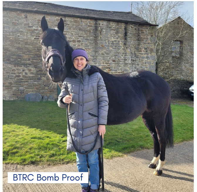
BTRC Bomb Proof