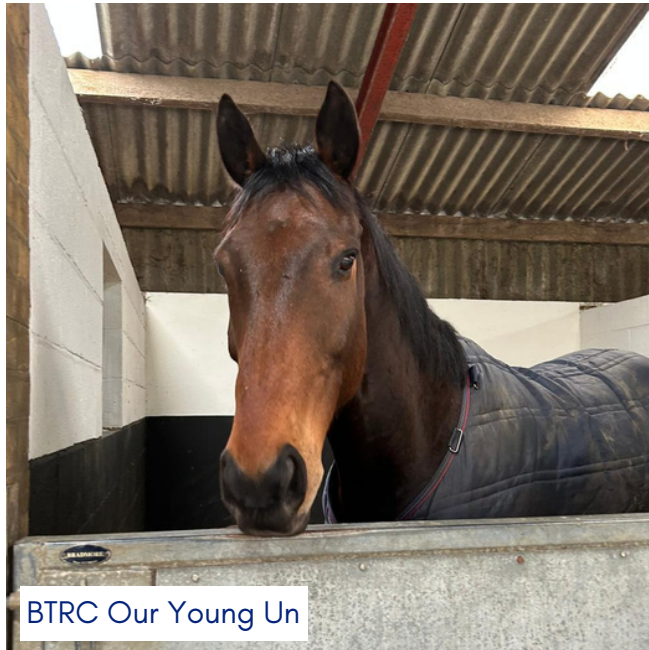
BTRC Our Young Un